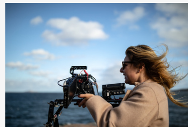
Russian Spy behind-the-scenes at Point King Lighthouse Ruins, Albany RussianSpy_BTS_21.png DOP Dasha Melnik outside Point King Lighthouse Ruins, Albany Point King Lighthouse Ruins, Albany