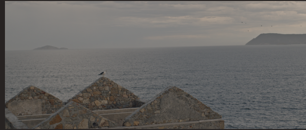
A still from Russian Spy RussianSpy_KeyArt_07.png A lightkeeper (or seagull) view of Frenchman's Bay. No Russian Ships today. Point King Lighthouse Ruins, Albany WA