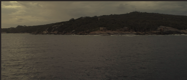
A still from Russian Spy RussianSpy_KeyArt_06.png Flying into Point King Lighthouse Ruins, with Mount Clarence radio tower in the background. Frenchman's Bay, Albany WA