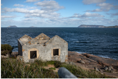
On location in Albany for Russian Spy RussianSpy_BTS_27.png Point King Lighthouse Ruins Frenchman's Bay, Albany