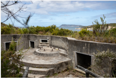
On location in Albany for Russian Spy RussianSpy_BTS_25.png The not-quite-famous gun emplacement has a great view of the bay, if you can find it. Frenchman's Bay, Albany, WA