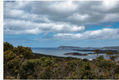
On location in Albany for Russian Spy RussianSpy_BTS_22.png Frenchman's Bay, Albany