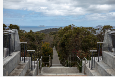
On location in Albany for Russian Spy RussianSpy_BTS_23.png The stairs to a war memorial Mount Clarence, Albany