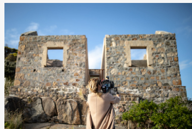
POV in a lighthouse full of stories RussianSpy_BTS_09.png DOP Dasha Melnik capturing the beauty of Point King Lighthouse Ruins, Albany Point King Lighthouse Ruins, Albany Image by Jennifer Piper © Jennifer Piper