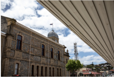
On location in Albany for Russian Spy RussianSpy_BTS_26.png Historic buildings on the streets of Albany Albany, Western Australia