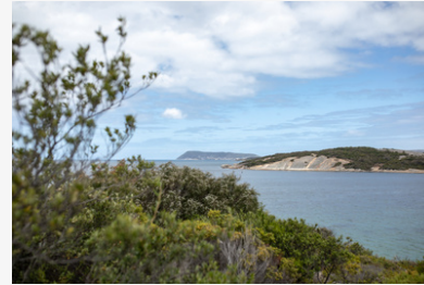
On location in Albany for Russian Spy RussianSpy_BTS_24.png Frenchman's Bay, Albany