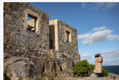
Russian Spy behind-the-scenes at Point King Lighthouse Ruins, Albany RussianSpy_BTS_20.png DOP Dasha Melnik outside Point King Lighthouse Ruins, Albany Point King Lighthouse Ruins, Albany